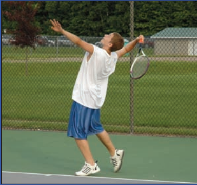
Tennis at Ma-Te-Way Park