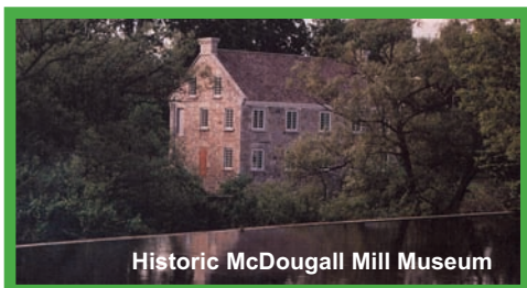
Historic McDougall Mill Museum