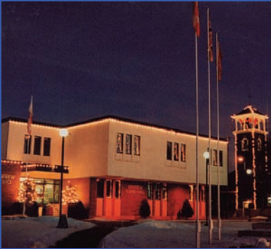
Town Hall in Lowe Square