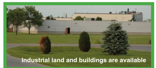
Industrial land and buildings are available