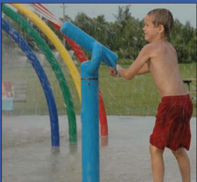
Children's Splash Pad