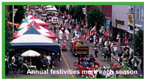
Annual festivities mark each season