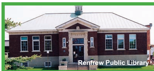
Renfrew Public Library