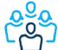
Loyalty Solutions & Merchant Cash Advance

Tailored Solutions to grow and manage your business one transaction at a time.