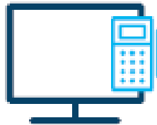
Integrated POS Solutions