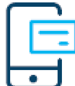
Mobile & Tablet Solutions